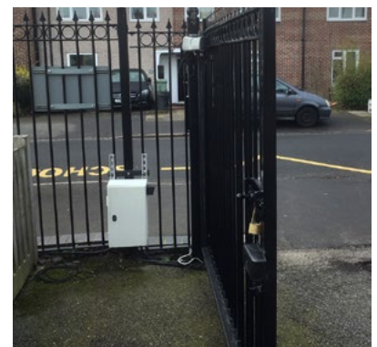
gate features no inside photocells