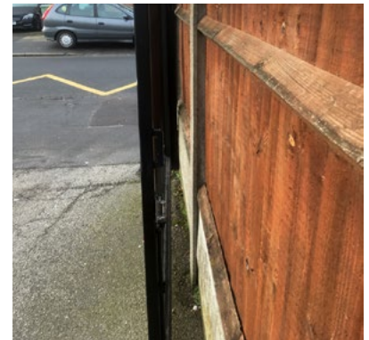
risk of gate crushing against a fence

Action taken: All Gate Safe's comments were taken on board and subsequently, the recommended works for upgrading the system were put out to tender.